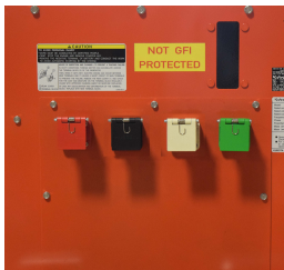
*Rear cam-lock connection option